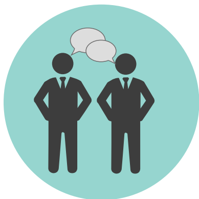
Communication within the state administration

It is subject to the general claim on transparency and legal accurateness. It is governed by the rules of representative democracy, administrative routines and political culture.