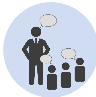
Communication between the state administration and local community

Available practices: local public debate, focus group, civic committee (panel), community association (local working group).