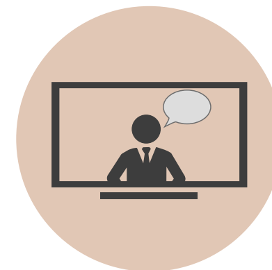
Communication with the general public

Available practices: round table, national working group.