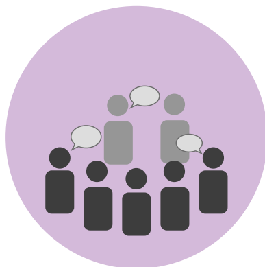
Communication in local community

It is subject to the general claim on transparency and legal accurateness. It is governed by the rules of representative democracy, administrative routines and political culture.